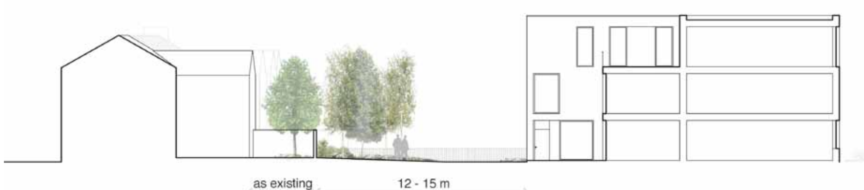
Section through Garden Mews