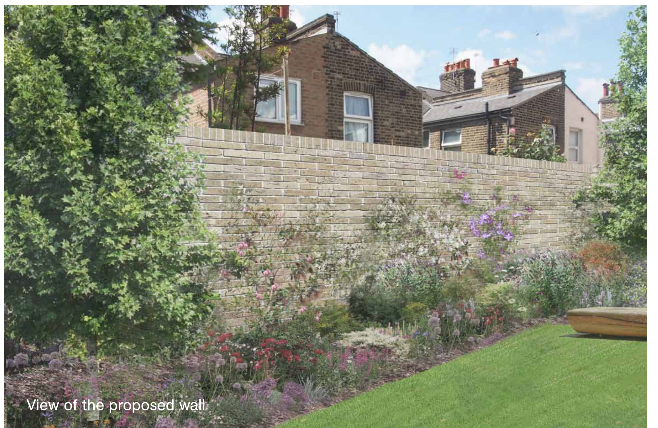
View of the proposed wall