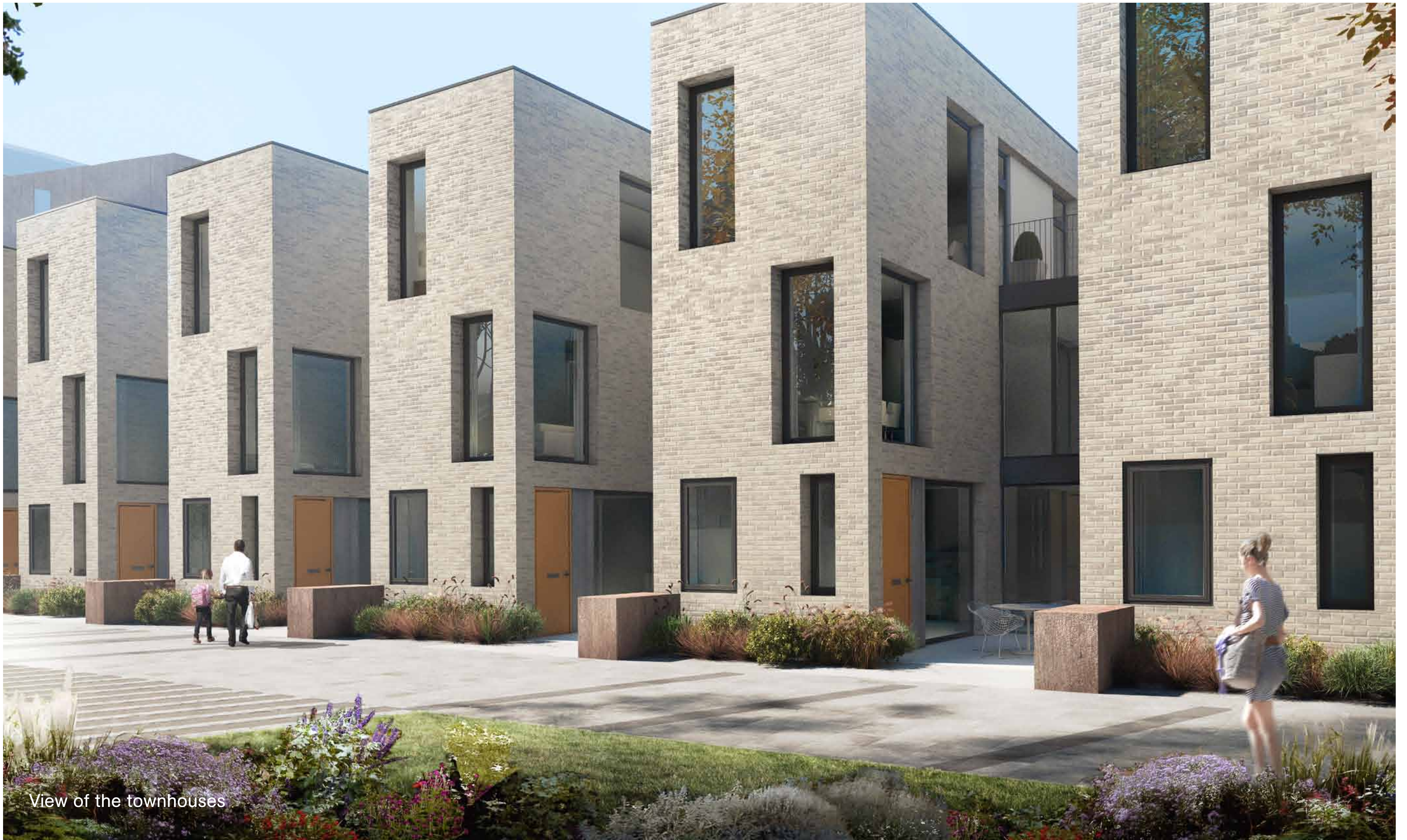
View of the townhouses

The application submitted includes proposals for the demolition and replacement of the existing Mauritius Road boundary wall. The replacement wall will be constructed from a high-quality brick, consistent with the product that will be used to construct the new residential scheme. Where possible, the proposals will also include some new landscaping along the boundary wall on the factory side, which will provide screening and improve the outlook from the existing properties.